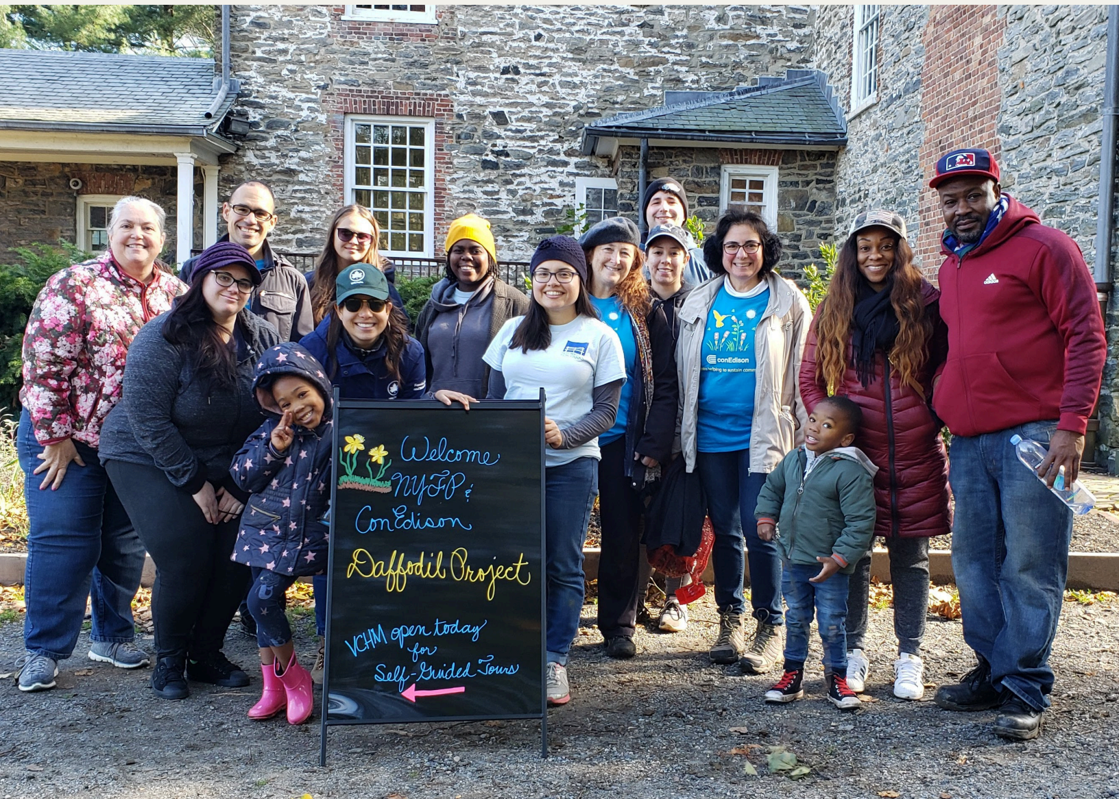
Pictured above: A group of corporate volunteers enjoying an afternoon of gardening at the Van Cortlandt House Museum in The Bronx

Connect with history in your own backyard, and explore all that New York City has to offer